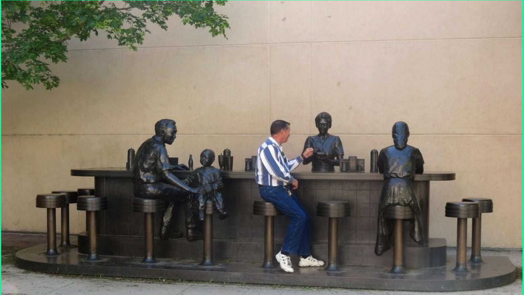
Lunch Counter Sit-In, Greensboro, NC