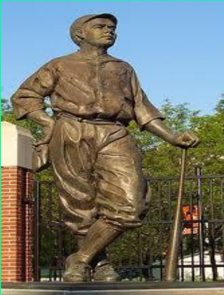
Babe Ruth – Baltimore, MD