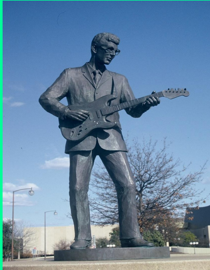
Buddy Holly – Lubbock, TX