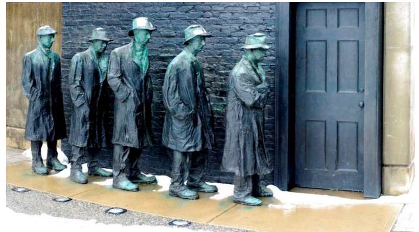
Unemployed Workers - DC