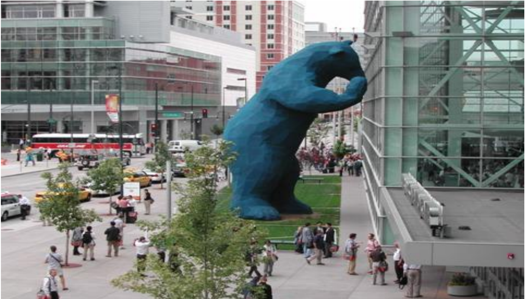
Big blue bear at Denver Convention Center