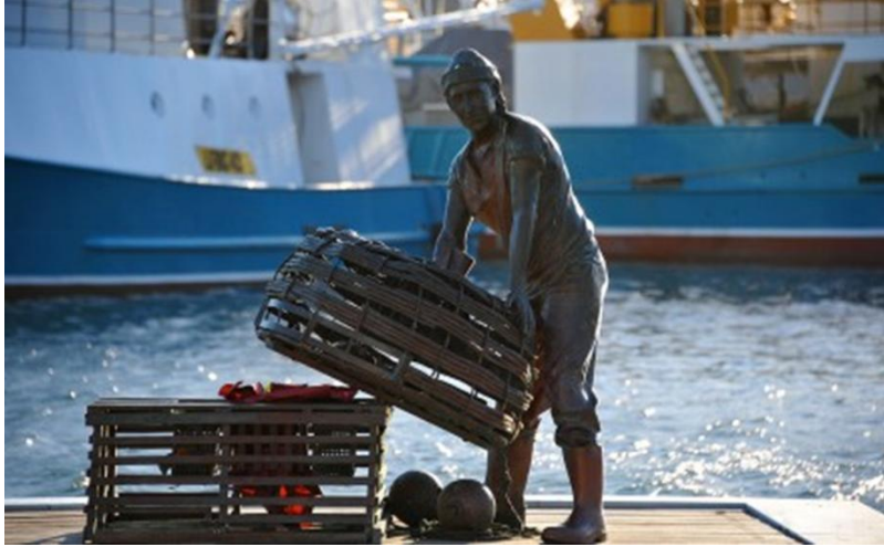
Waterman – Massachusetts