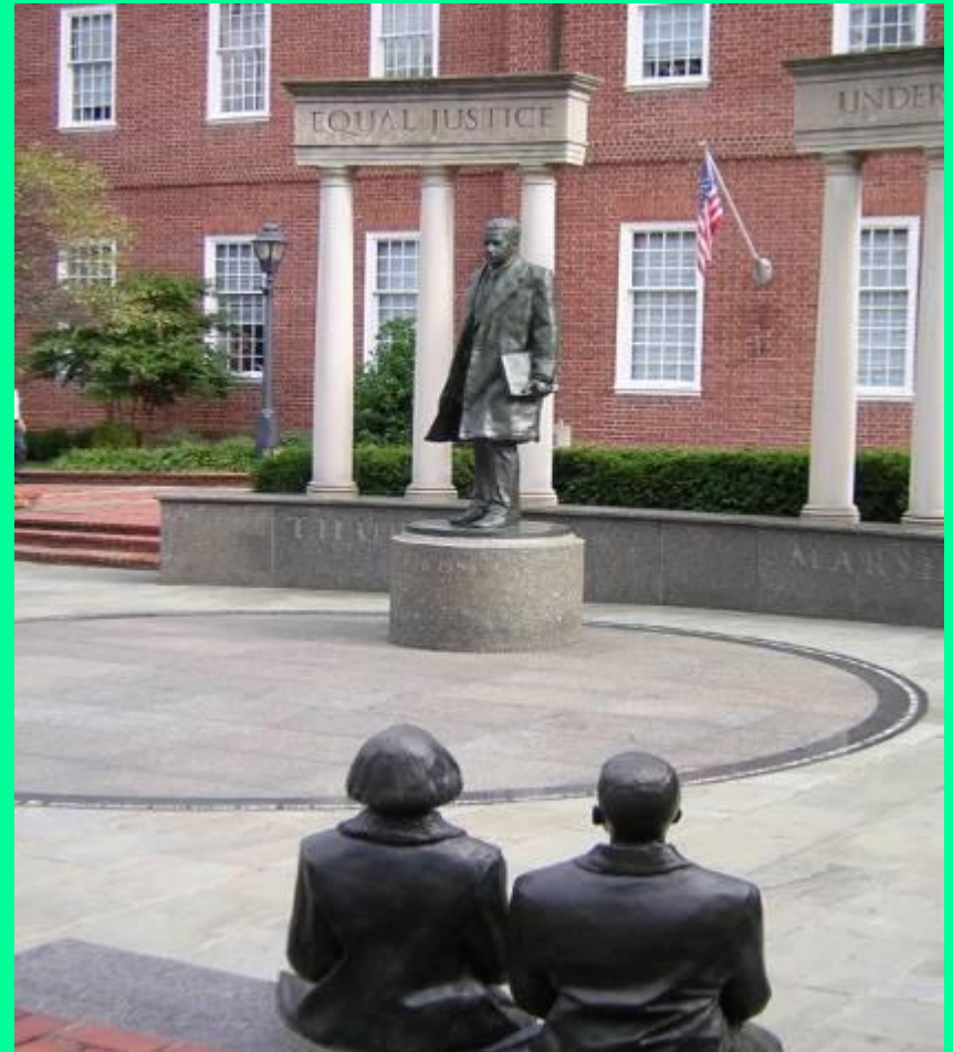
Thurgood Marshall Statue, Annapolis, MD