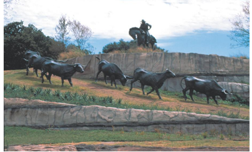
Ranchers – Texas