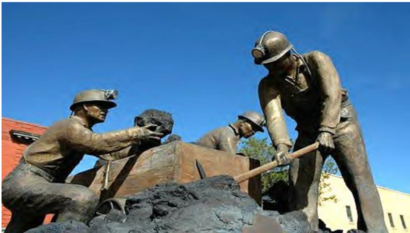
Coal Miners – Pennsylvania