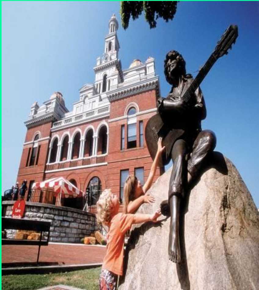
Dolly Parton Statue, Sevierville, TN